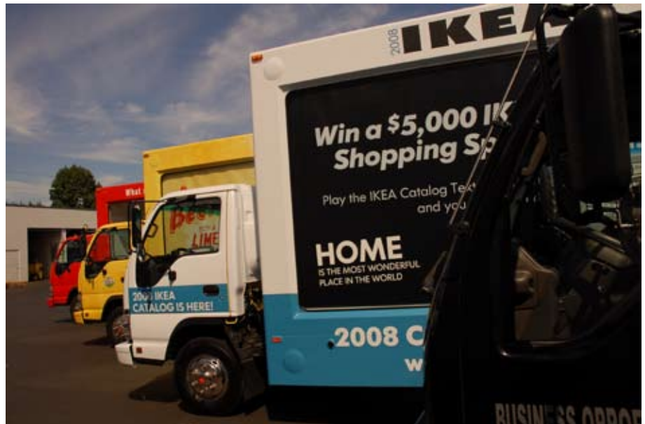
Four GoMobile Vehicles lined up just four months earlier, when the company was at a mere 75 vehicles.

work, our top priority is market coverage for the national advertisers. While Hitting 100 is just a number, it is a celebratory marker that represents the steady growth of this medium. And this kind of growth could not happen without the loyalty, commitment and creativity we see every day from our affiliates.”